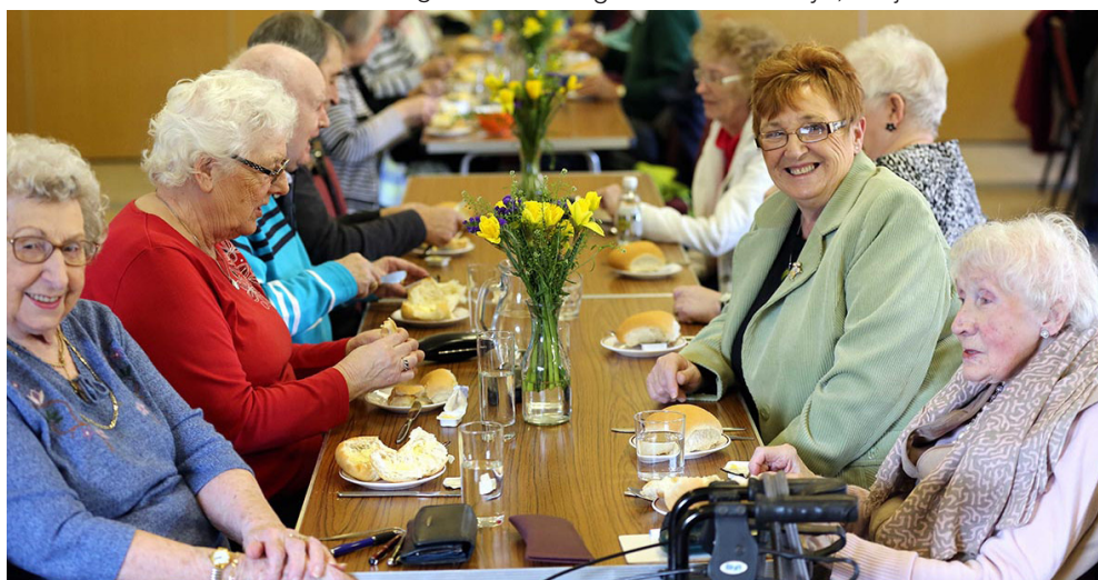
As a thank you to the village for their patience and understanding, Wales & West Utilities bought ten flower arrangements and vases for that week's over 50 club lunch, but the biggest reward was being able to turn the heating back on in our homes.

It took 16 hours to find the fracture on the eight-inch main in Bryn, but just 30 minutes