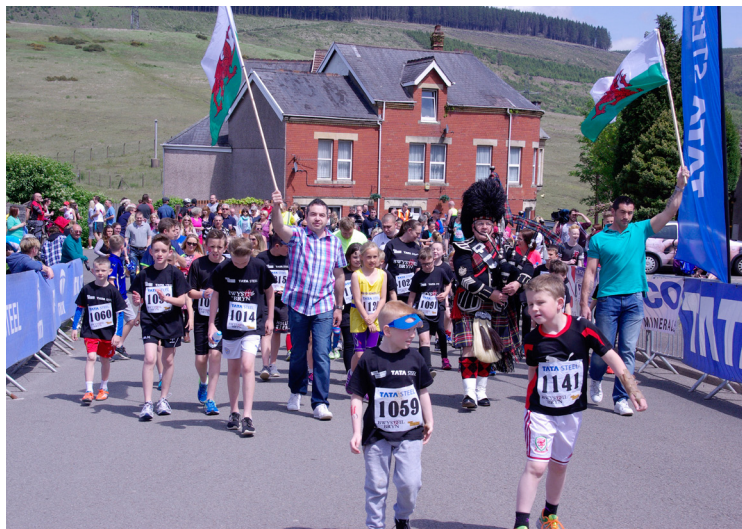
2k runners following the piper to the start line.