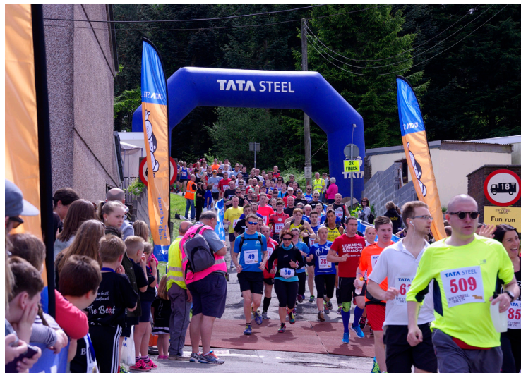
The Bwystfil y Bryn Race gets under way with a record number of runners.