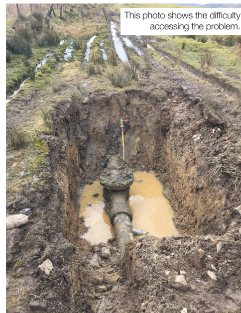
This photo shows the difficulty accessing the problem.

to repair it after checking 1,800 metres of pipe and digging 15 access holes for the inspection camera which located the crack where the water from the bog was coming in.