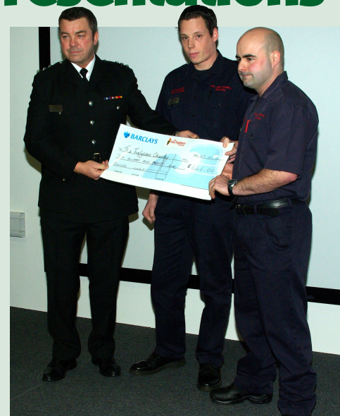
Firemen presenting a cheque to the Fireman's Benevolent Fund for £600. These firemen ran the 10K in full outfits carrying a BA Cylinder on their back!

Get in touch! Visit the village website at: www.bryn-porttalbot.btck.co.uk