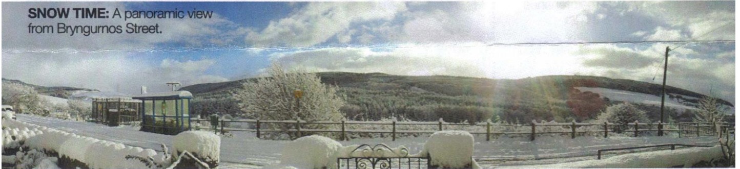
SNOW TIME: A panoramic view from Bryngurnos Street.

BRYN: A NICE PLACE TO BE / BRYN: LLE DEDWYDD I FOD Issue #020 February 2013