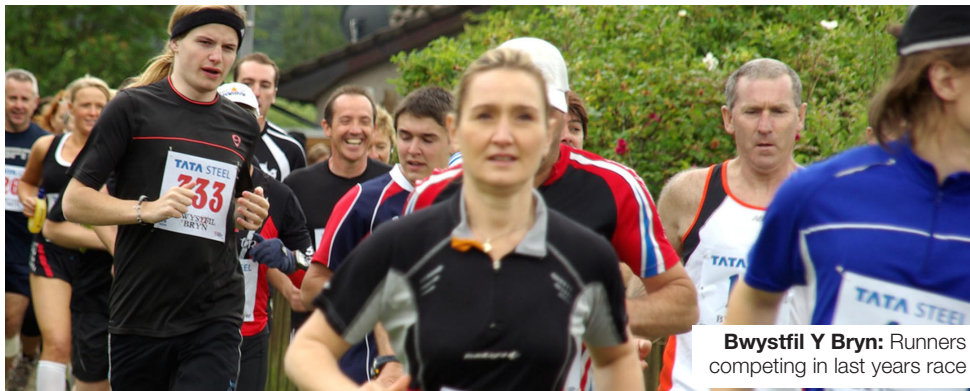
Bwystfil Y Bryn: Runners competing in last years race