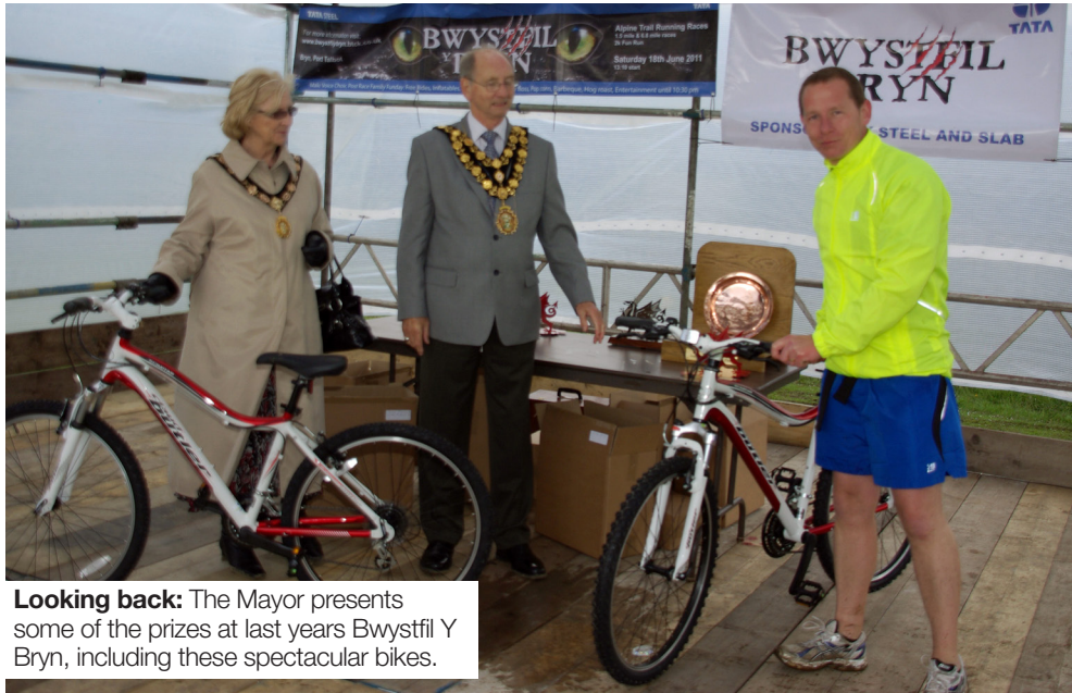
Looking back: The Mayor presents some of the prizes at last years Bwystfil Y Bryn, including these spectacular bikes.